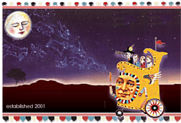
Ritual of Unity and Blessing Meditation